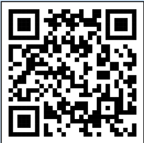
Scan Here For NEFT Details